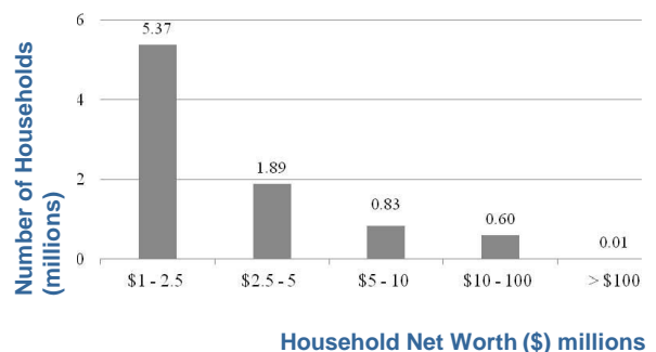
Number of US Households that Qualify as Accredited Investors Based on 2010 Net Worth

Raising them for inflation (to $450K income and $2.5M net worth) would eliminate nearly 60% of eligible households, severely impacting the capital raising efforts of innovative small businesses, which in turn will result in fewer jobs and less growth. Crowdfunding is not a substitute for maintaining the current base of accredited investors.